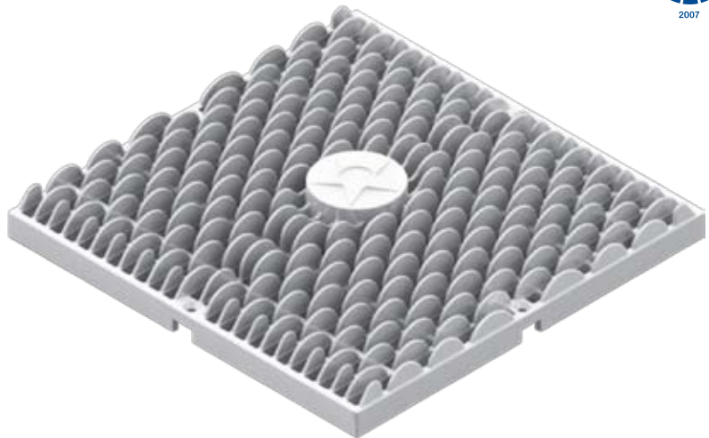
Model # WAV9xxx

*Fits: AquaStar (p/n 9xxx, pre-VGB "flat"); Pentair (#1) with 3/4" deep existing frames and 4 hole screw pattern